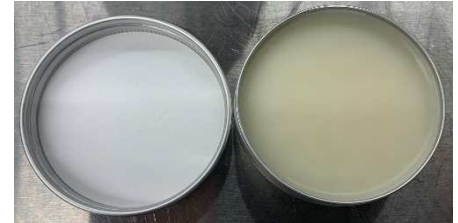
Product of Vermont USA