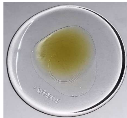
Product of Vermont USA